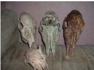
Possible Poaching Reported