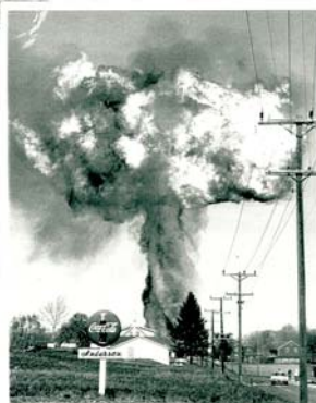
10:25 AM Explosion 22 Injured, Evacuation begun.

The floodplain located downstream of the 131-acre site. Waiver granted on 4/2/7 to allow increase in volume of runoff.