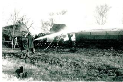
Fires in nearby forest were battled over the next 24 hours.